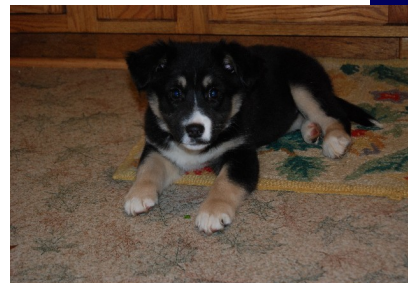
Mena, one of Maggie's puppies, found a new home with a family who shares the cutest photos.