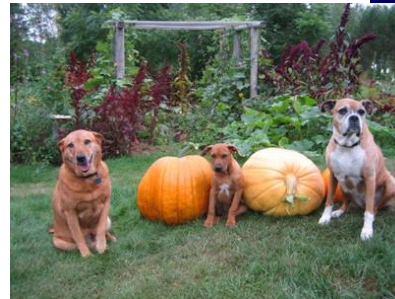
Here is our little Dillon, a boxer mix puppy, posing for a photo with his new sisters.