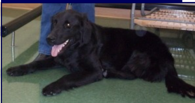
Dukey may only have three legs but that doesn't slow him down!