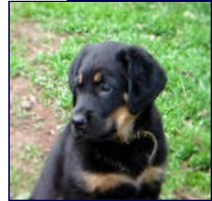
Renegade was our first official BARK dog.

We are happy to say that he found a loving home. He has canine and human playmates. His new human brother is a student in the school where one of our volunteers works, so we are able to get regular updates on his puppy antics.