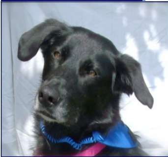
Raven, the perfect canine companion

While we love what we do, we all hope that there comes a day when rescue is no longer needed. If your pets are already altered, consider helping someone else get their animals fixed. Sometimes offering a little financial assistance is all that is needed.