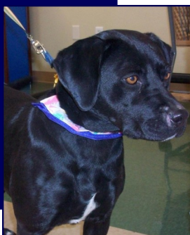
Blackie, one of our black beauties looking for a home

Petunia-A leggy black and white Collie mix. Spunky and silly.